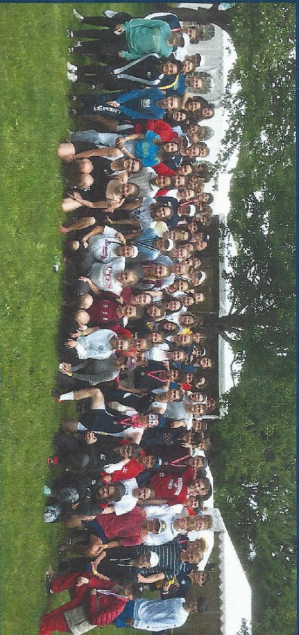
Bainbridge Island Rowing 2019 Junior Team

COMARADERIE HOPE GRIT STRENGTH JOY BALANCE LEADERSHIP INCLUSION TRUST HEALTH CONNECTION SUPPORT COMMUNITY HAPPENS HERE