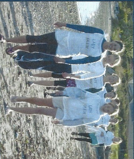
Bainbridge Island Rowing, 2001

"Rowing on Bainbridge was the result of the community, the parents, the volunteers standing behind the program and recognizing that an island needs as many sports as it can for the kids. This effort obviously worked. It's a success. I'm very optimistic about following its growth in the years to come."